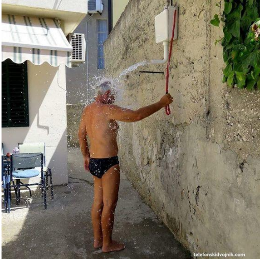
KAD MORAŠ DA ISPEREŠ SVA SRANJA KOJA SU TI SE NAKUPILA TOKOM DANA...

The caption says “When you have to wash away all the crap that has accumulated during the day!”