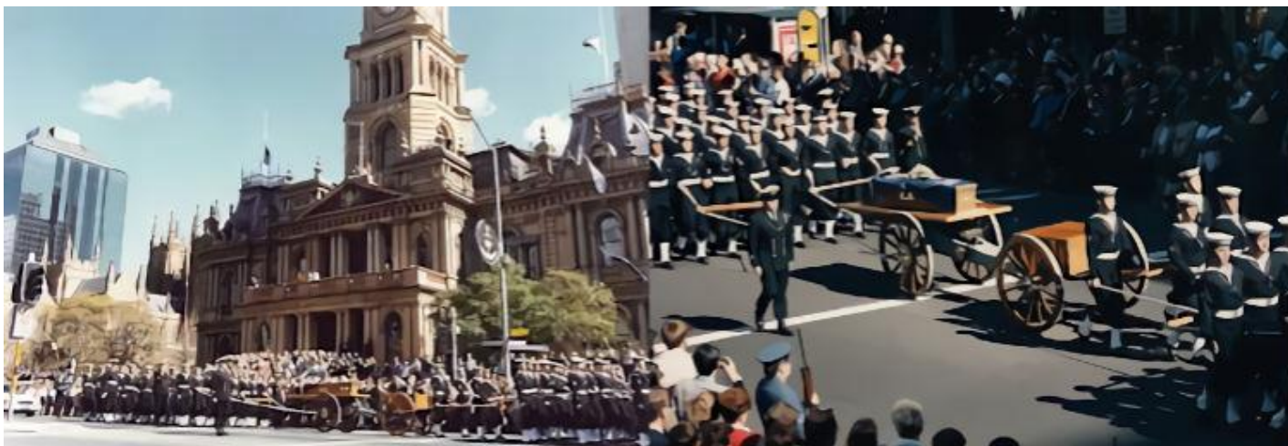
State Funeral for Rear Admiral Sir David James Martin KCMG AO RAN

On 7 August 1990 he and Lady Martin left Government House intending to retire in Sydney. Survived by his wife, and their two daughters and son, he died at Darlinghurst three days later, on 10 August, aged 57, and, after a State funeral, was cremated.