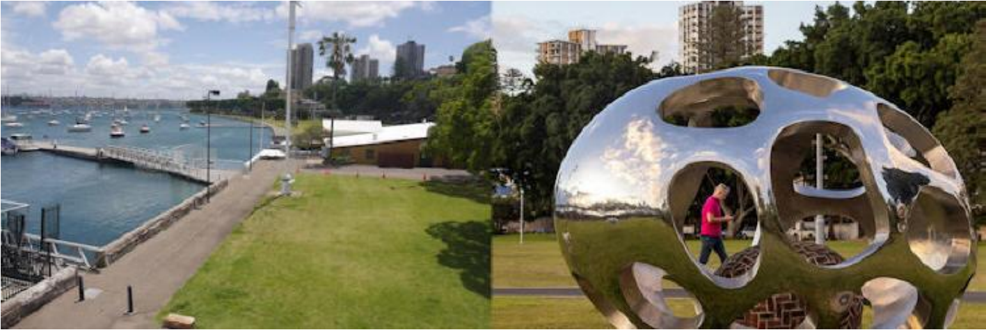
Sir David Martin Reserve, Rushcutters Bay

After his death, Woollahra Council named the former site of HMAS Rushcutter in Rushcutters Bay as the "Sir David Martin Reserve" in his honour.