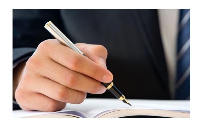
From the President