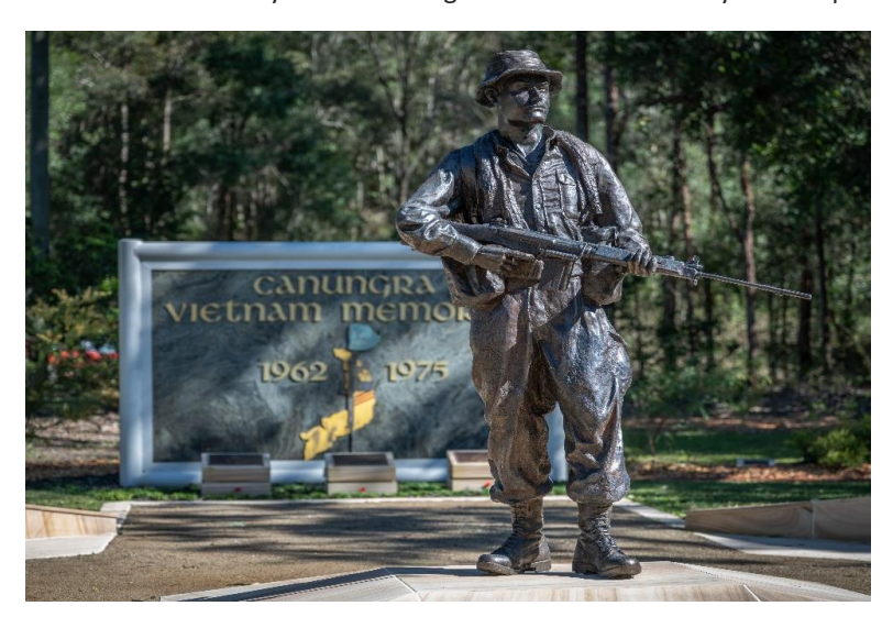
The "Little Digger"

The inaugural Vietnam Veterans Memorial Day was held at the newly established Memorial at Kokoda Barracks Canungra where approx. 300 guests observed the laying of Military Plaques and Wreaths of those Units involved in the Vietnam War. This memorial replaced the original which was built in 2000 within the confines of the Army Base. This is now available to public access being located at the main entry to the Canungra base where so many trained prior to service in Vietnam