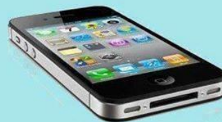
The phone I had when I was six